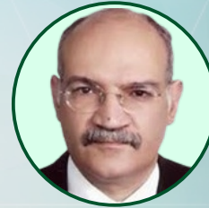
Gamal Hosny Egypt