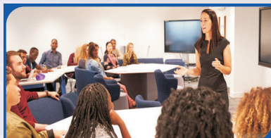
TIPS FROM MASTERS-DIFFICULT CASES AND HOW TO TACKLE THEM