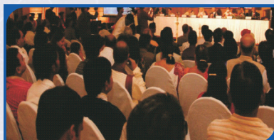
DISCUSS COMPLICATIONS AND BAIL OUT OPTIONS WITH THE MASTERS