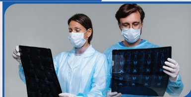
CURRENT CONCEPT IN TRAUMA PRACTICES