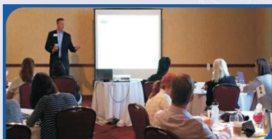
EMPHASIS ON EVALUATION, PLANNING, REDUCTION TECHNIQUES AND DECISION MAKING