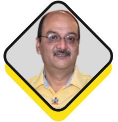
Chinmoy Das (Dispur) Why add methotrexate with biologics?