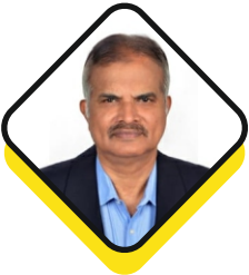
Aa Rajamani (Madurai) Cytokine Inhibitors